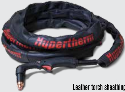
Leather torch sheathing