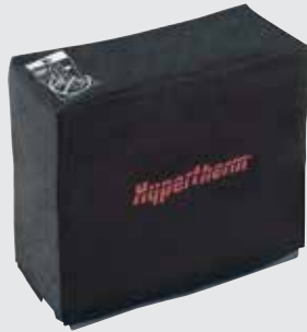
System dust cover