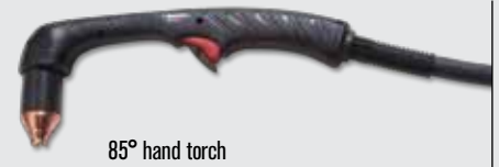
85° hand torch

(for more torch options, see www.hypertherm.com )