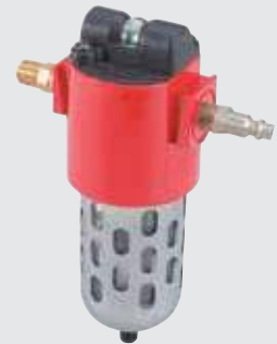
Air filtration kit